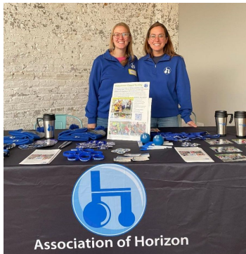
Looking for volunteers at the Logan Square Volunteer Fair in October.