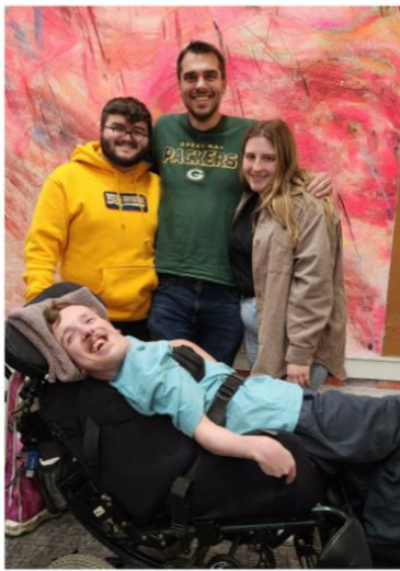
NEW BOARD MEMBERS