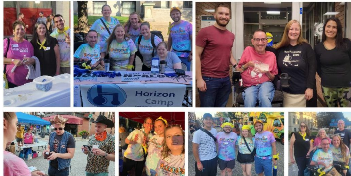
Volunteering at Bruegala: a Festival of Beer in Bloomington in September.