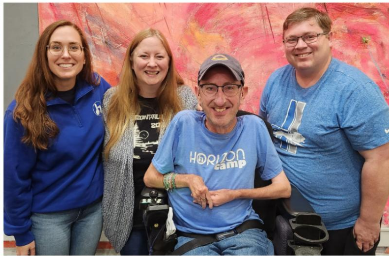
EXECUTIVE BOARD MEMBERS