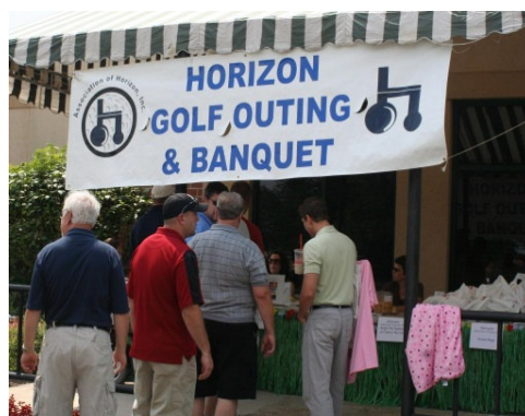
Pictured Above: Golfers lining up to register and get their hole assignments.