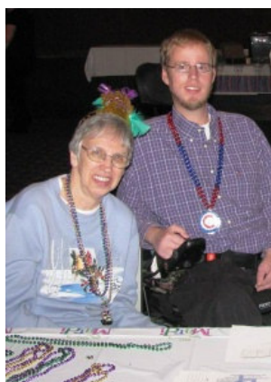
Pictured Above: Mardi Gras hosts showing off their beads!