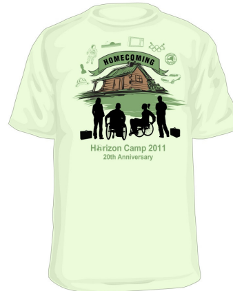
Pictured Above: The official 2011 camp T-shirt. Not coming to camp but want to have an official camp shirt? Watch our website for details on how to order one.

Our cabin theme will be colleges (real or your own creation) so bring fun items to decorate and show your school pride! Visitors Day is set for Friday, July 29th and we would LOVE to see many camp folks that we haven't seen for years! After all....that's what HOMECOMING is all about!!