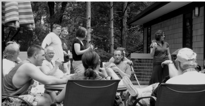
2007 Team Leaders meet on the deck outside the mess hall

roles please check out the application that is posted on the Horizon website. There are two different applications, one for Team Leaders and one for Logistics and Activities, so please be sure to download the right form.